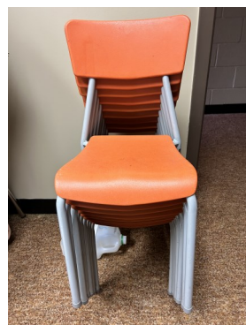
11 children's chairs

7 Wooden Table Extensions (could be retrofitted into tables)