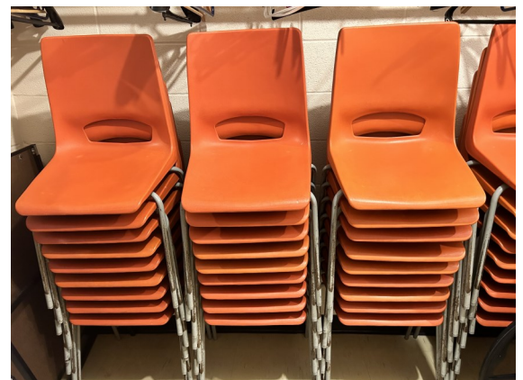
The Orange Chairs that were in the parlour.