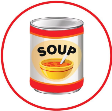
Large Canned Soups