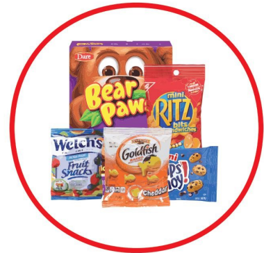
Sweet & Savoury Snacks

You can drop off donations at Stratford House of Blessing Food Bank at 423 Erie Street on Monday – Friday from 8:30AM – 4:30PM