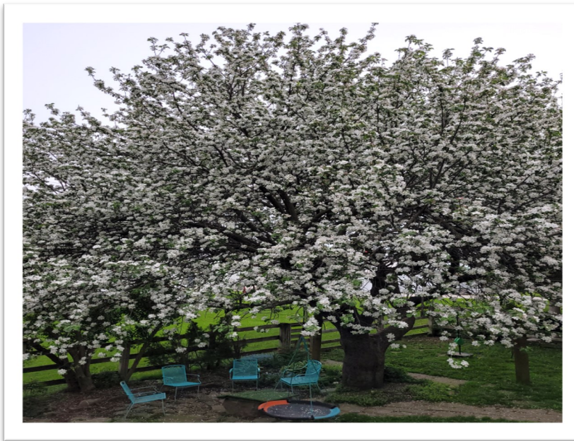
Apple tree in full bloom. Last remaining apple tree from Hope St West apple orchard (Sommers).