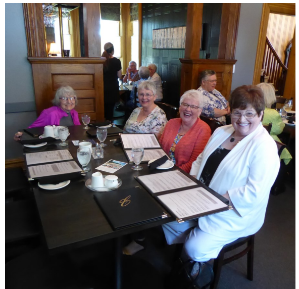
Some UCW ladies enjoying lunch on a June day trip