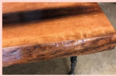
Examples of items donated last year!

To donate an item for the auction, email treasurer@campbimini.ca to arrange pick up by October 1