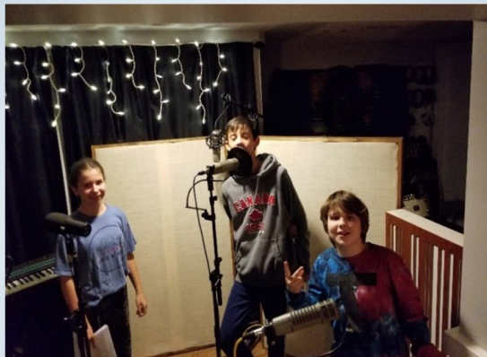
Podcast Invites Children to Engage Deep Spiritual Questions

The podcast takes a creative approach to encourage children to explore their imagination and faith without using screens. Described as "Narnia with kid actors and a soundtrack," the adventurous storyline released in 15-minute episodes every Monday through the summer,