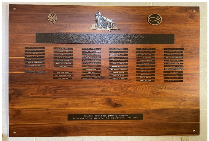
Grace United Church Memorial Plaques on display in the 'Welcome and Inclusive Entrance'

We are planning to place an order for Memorial Plaques. Please be in contact with Tory Zehr 519 608 2505 if you would like to place an order in memory of your loved one. The cost for a Memorial plaque is $250.